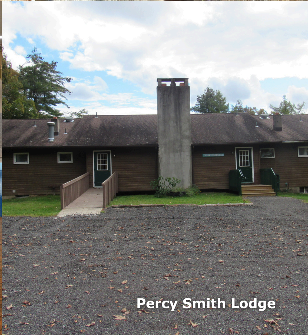
Percy Smith Lodge